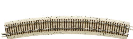
Item# 2495- N Scale True Track 17" Radius

Pre-production models shown. Colors may vary.