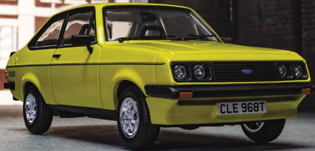
VA14900 Ford Escort Mk2 RS2000 Custom Signal Yellow

NEW TOOL | Length 95mm | Limited Edition