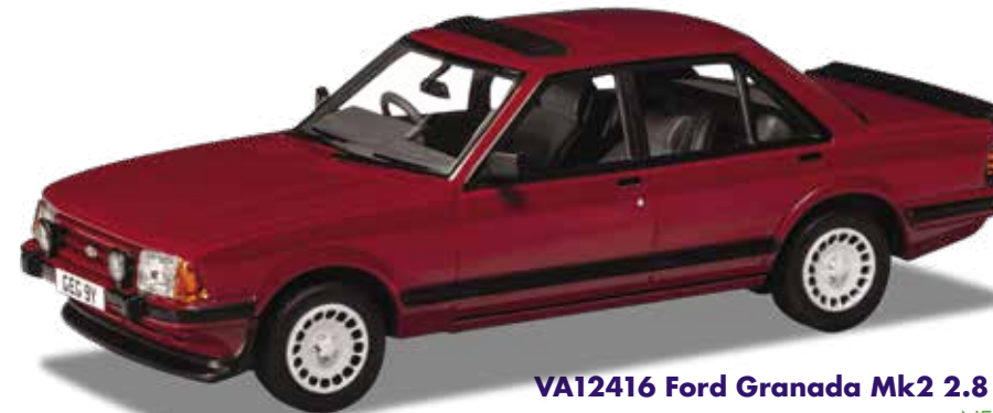
VA12416 Ford Granada Mk2 2.8 Injection Sport Cardinal Red NEW | Length 109mm | Limited Edition

Built by Ford using engines and components supplied by Lotus, the Cortina Mk2 Twin Cam was released in 1967 and saw 4032 examples built in the three years it was available on the market.