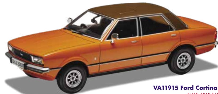
VA11915 Ford Cortina Mk4 2.0 Ghia Signal Orange AVAILABLE NOW | Length 102mm | Limited Edition

A strong seller throughout its lifetime, the Ford Granada Mk2 featured numerous stock engine specifications from the manufacturer, with the most powerful featured aboard this immaculately restored model – the 2.8 litre Injection Sport.