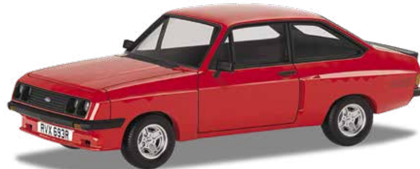
VA14902 Ford Escort Mk2 RS2000 X-pack Venetian Red

Highly distinctive in both shape and colour, this newly tooled Ford Escort Mk2 RS2000 recreates the performance car that every young professional in the mid to late 70's really wanted!