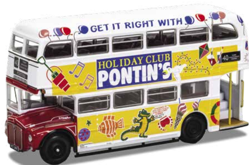
OM46317 AEC RM • Blackpool Transport Pontins