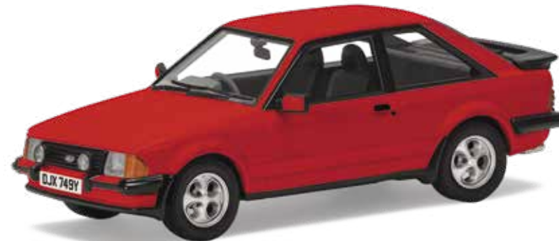
VA11014 Ford Escort Mk3 XR3i Sunburst Red

The base Ford Escort Mk2 RS2000 was a beast, but the addition of X-Pack performance options dialled the car specs up to 11. This newly tooled release recreates a dream car of the RS enthusiast.