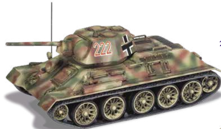
CC51606 Beutepanzer (Trophy Tank) Captured Soviet T34/76 Model 1943, Turret No.222, Panzerjager Abteilung 128, 23 rd Panzer Division, Eastern Front, Ukraine, 1943 AVAILABLE NOW | Length 120mm | Limited Edition