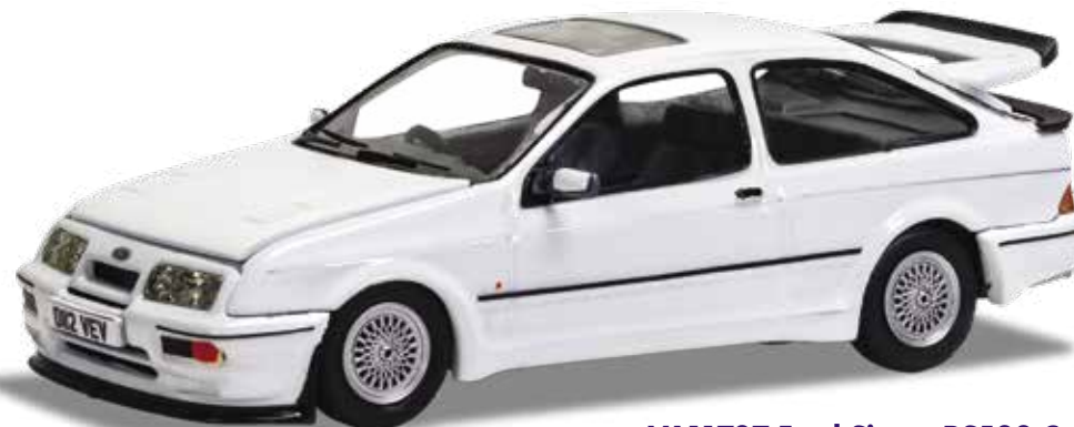
VA11707 Ford Sierra RS500 Cosworth Diamond White NEW | Length 104mm | Limited Edition

The Ford Cortina Mk4 2.0 Ghia was the top model for economy minded company car users of the late 70s and was luxuriously equipped for its era, featuring a wood-veneer dashboard and door cappings among its many perks.