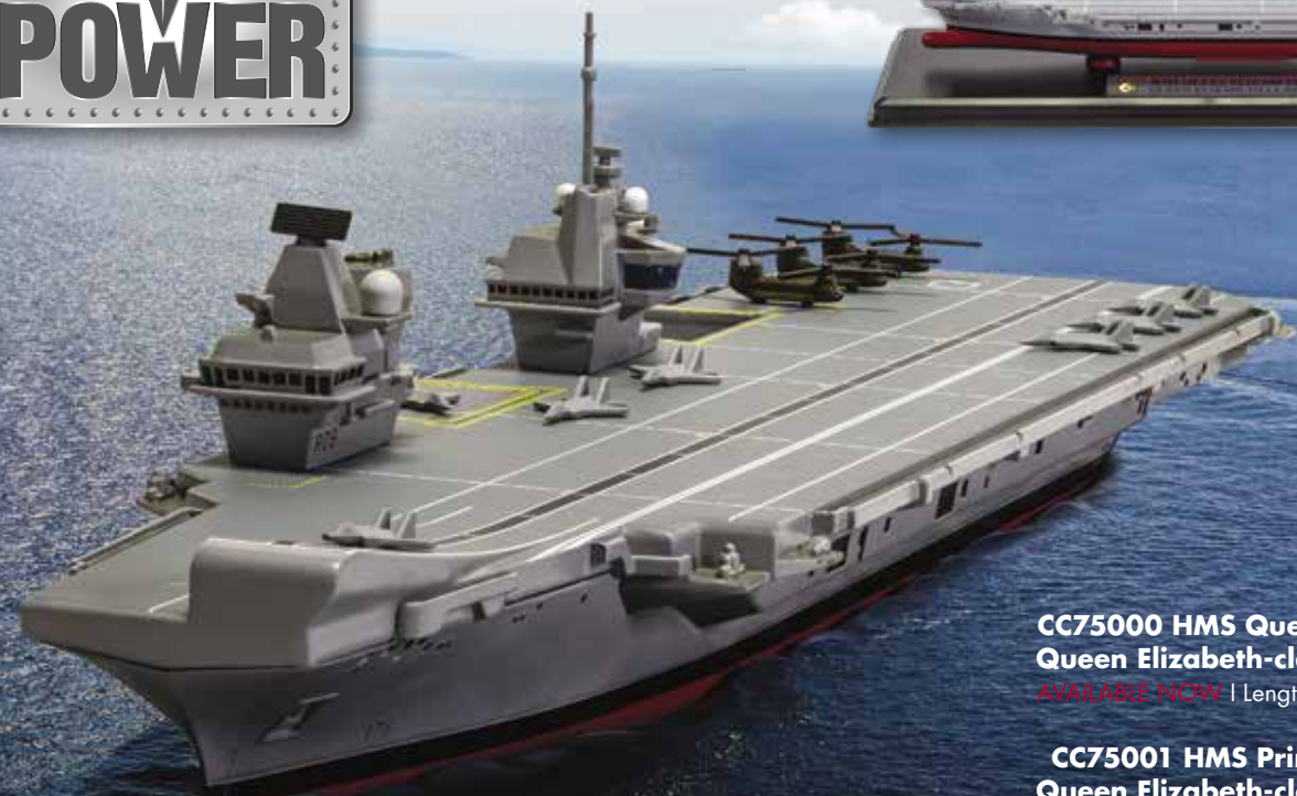
CC75000 HMS Queen Elizabeth (R08) Queen Elizabeth-class aircraft carrier AVAILABLE NOW | Length 224mm | Scale 1:1250