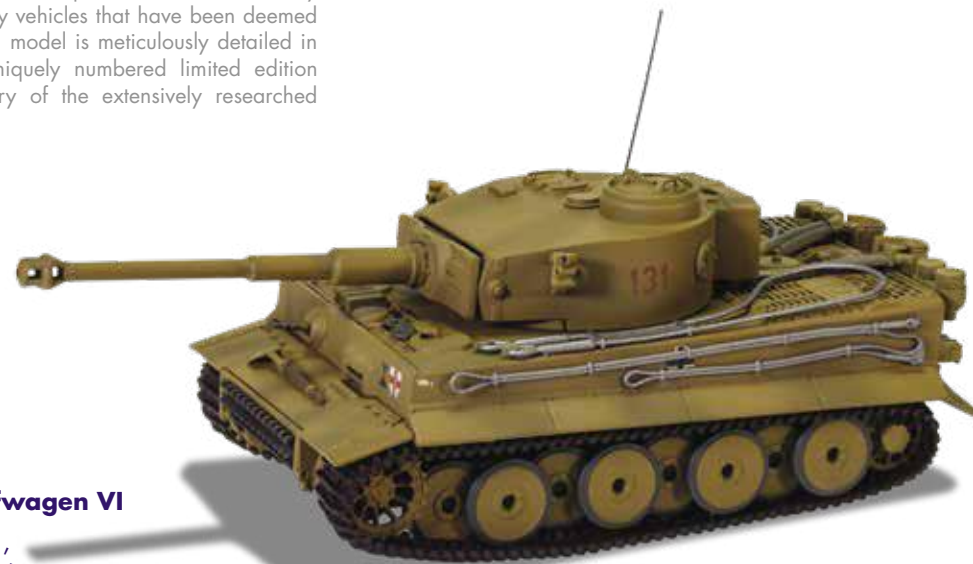
CC60516 Panzerkampfwagen VI Tiger Ausf E (Early production), 'Tiger 131', Displayed on Horse Guards Parade, London NEW | Length 170mm | Limited Edition

From airfield support to general transport vehicles, the Military Legends range includes military vehicles that have been deemed legendary. Each die-cast metal model is meticulously detailed in 1:50 scale. All include a uniquely numbered limited edition certificate which tells the story of the extensively researched military vehicle in question.