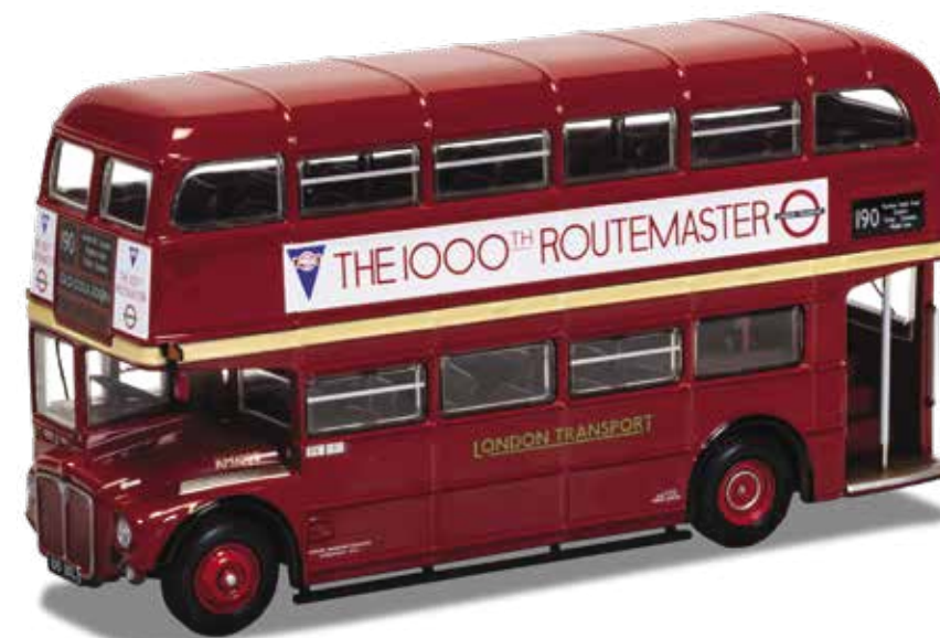
OM46318 AEC Routemaster London Transport 1000 th RM

The backstory, bright and beautiful liveries, special features and statistics of every Original Omnibus are meticulously researched to bring the most accurate 1:76 scale replicas to the market. Each Original Omnibus is secured to a removable display plinth and is presented in a high quality perspex display box. Every model includes a bespoke, individually numbered, limited edition certificate which details the full fascinating history of the bus concerned.