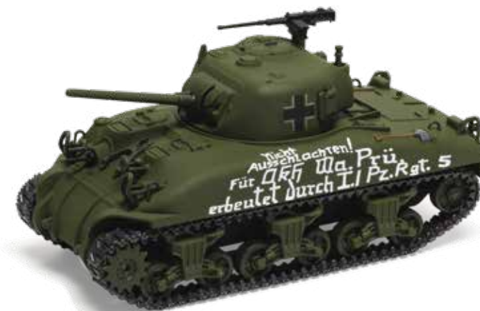
CC51032 M4A1 Sherman 'Beutepanzer' (Trophy Tank), US Army, North African Campaign, Captured by I./Pz.Rgt.5, Tunisia, Early 1943 NEW TOOL | Length 116mm | Limited Edition