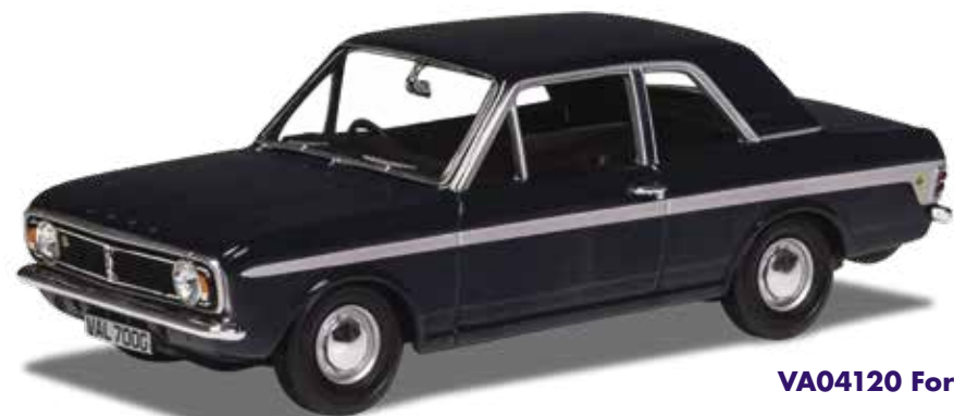
VA04120 Ford Cortina Mk2 Lotus Anchor Blue NEW | Length 103mm | Limited Edition

Built by Ford using engines and components supplied by Lotus, the Cortina Mk2 Twin Cam was released in 1967 and saw 4032 examples built in the three years it was available on the market.