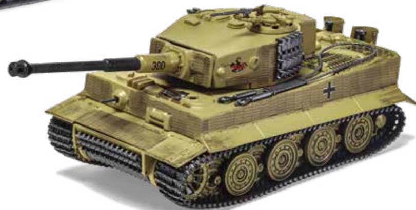
CC60514 Panzerkampfwagen VI Tiger I Ausf E (Late production), Turret Number 'Black 300', sPzAbt. 505, Eastern Front, Summer 1944 - Russia on the offensive AVAILABLE NOW | Length 170mm | Limited Edition