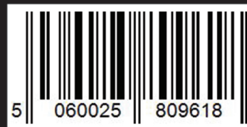
GM9961 GM Tools Leaflet 1st Edition

Gaugemaster Controls Ltd, Gaugemaster House, Ford Road, Arundel, West Sussex, BN18 0BN, United Kingdom Tel - +44 (0) 1903 884321 Fax - +44 (0) 1903 884377 E Mail - sales@gaugemaster.co.uk Web - www.gaugemaster.com - www.airfix-shop.com - www.scalextric-shop.com