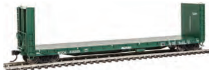
BC Rail - BCOL

920-104327 #818466 920-104328 #818474 920-104329 #818500