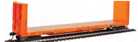
Canadian National - Orange Patch

920-104330 #603170 920-104331 #603185 920-104332 #603260