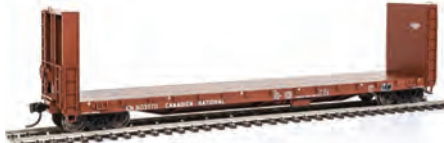
Canadian National - Brown

920-104327 #818466 920-104328 #818474 920-104329 #818500