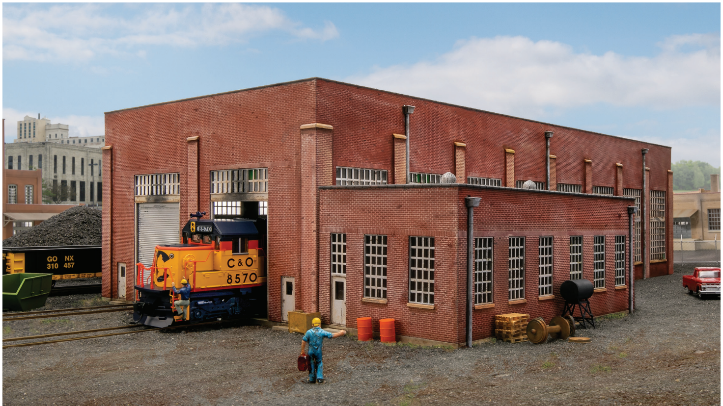
Figures, vehicles, and scenery items not included.