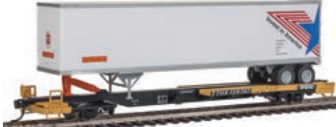
910-5016 #135747 w/XTRA Trailer