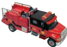
7600 2-Axle Crew Cab Brush Fire Truck