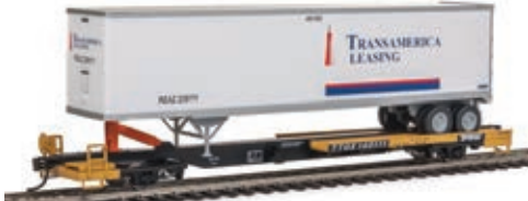
910-5017 #140111 w/TransAm Trailer