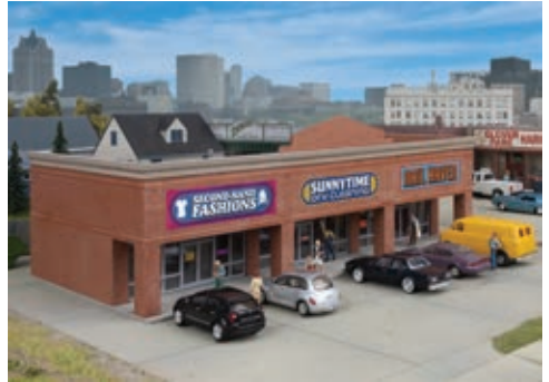
933-4115 Modern Shopping Center 10-1/2 x 4-15/16 x 3-1/2" 26.6 x 12.5 x 8.8cm