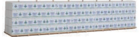
949-3122 Finlay Forest Industries