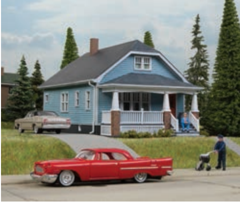
933-3787 American Bungalow 6-11/32 x 3-5/8 x 3-1/2" 16.1 x 9.1 x 8.8cm