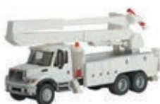
7600 Utility Truck w/ Bucket Lift