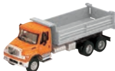
7600 3-Axle Heavy-Duty Dump Truck