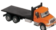
7600 3-Axle Flatbed