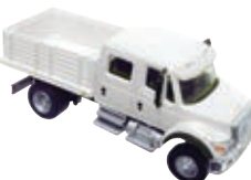
7600 2-Axle Crew Cab w/ Solid Stake Bed