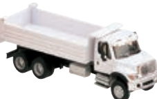
7600 3-Axle Heavy-Duty Dump Truck