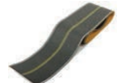
Vintage & Modern No Passing Zone