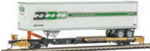
910-5014 #130054 w/BN Trailer