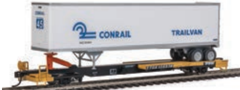
910-5015 #135538 w/CR Trailer