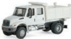
4300 Two-Axle Crew Cab Dump Truck

Decals included with Utility Company Equipment models.