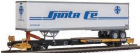
910-5013 #121429 w/ATSF Trailer