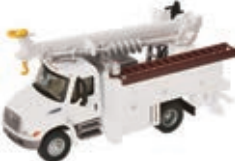
4300 Utility Truck w/Drill