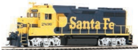
Santa Fe (Yellow & Blue Freight Warbonnet®)

920-42163 #2896 Tsunami Sound & DCC 920-42164 #2907 Tsunami Sound & DCC